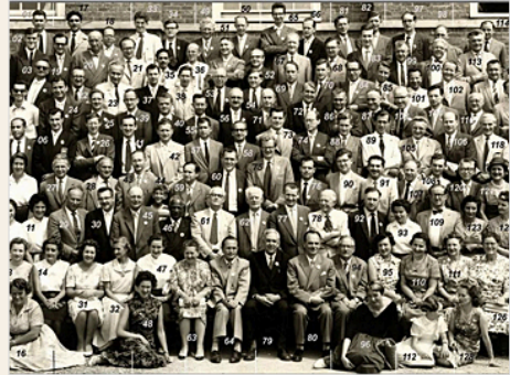
Members of Radiation and Ozone Commissions, Oxford, 1959