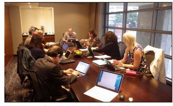
Site Visit Meeting in Cape Town

welcome your participation and cooperation!